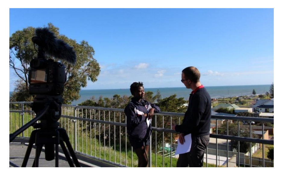
Filming at Bunbury Senior High School