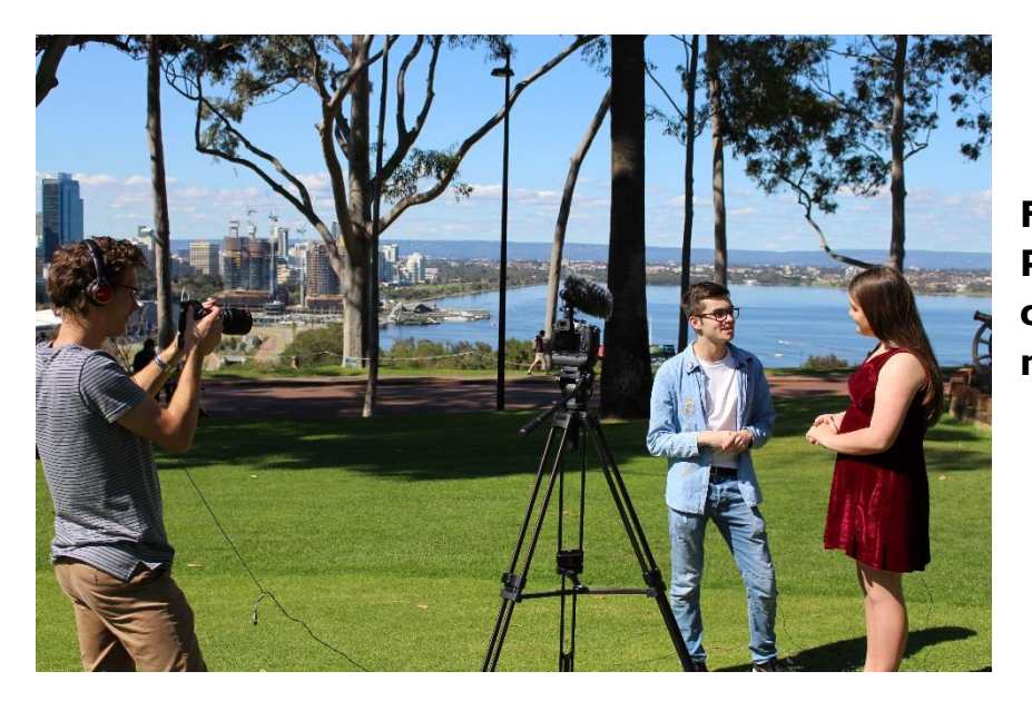
Filming with Perth committee members

A small group of the Perth and Bunbury committee members worked to plan and develop video education tools about LGBTI diversity, which aimed to be used by schools in classrooms, or as professional development resources for teachers and school staff, or other organisations working with children and young people. The group felt the development of these videos was an important way of addressing some of the committee's priority areas around schools and education, as well as improving understanding and awareness about LGBTI children and young people to address and hopefully decrease the discrimination, bullying and harassment that many face. All aspects of the video were decided on by the committee members, including the content of the videos, their style, who was to be interviewed on camera, the video's target audiences and filming locations. Committee members were interviewed for the videos, as well as staff from Bunbury Senior High School and the Freedom Centre.