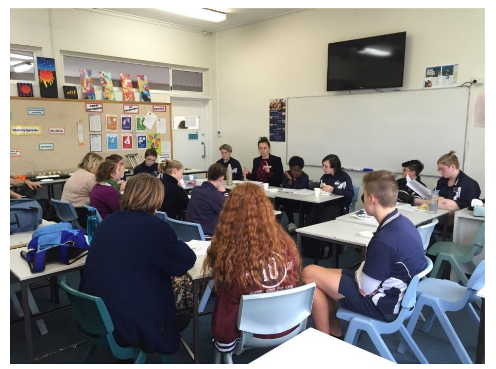
Bunbury committee meeting