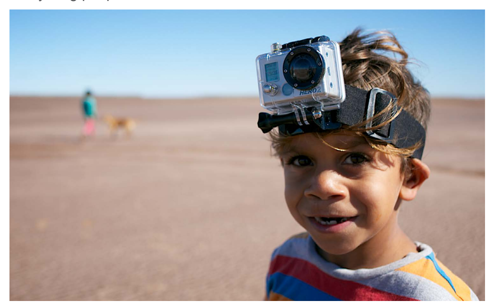
A young boy from Punmu participates in the 2013 Creative Challenge. The Commissioner is partnering with Awesome Arts on this project.

The Wellbeing Monitoring Framework includes a focus on the wellbeing needs of Aboriginal children and young people. The Profile of Children and Young People in Western Australia was updated in April 2013 and provides specific socio-demographic data concerning Aboriginal children and young people.