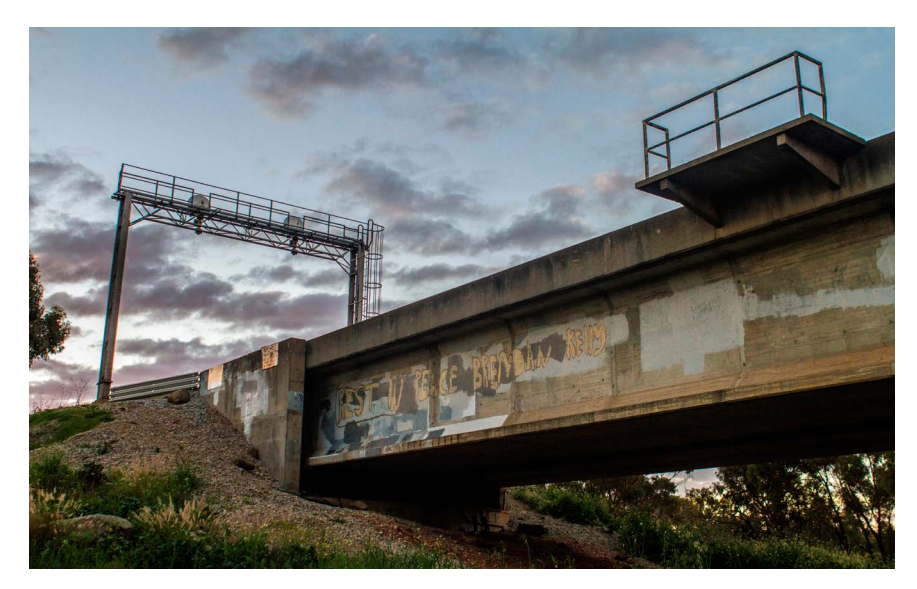
Home Is Where My Heart Is 2013

In 2012–13 work commenced with a number of media outlets to promote the views of young people under 18 years of age being heard in the mainstream media.